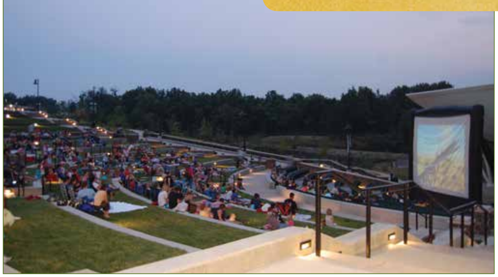
Movies Under the Stars debuts June 14 at the Chesterfield Amphitheater with "The Lorax."

This is an ideal way to memorialize a family name, pay tribute to a military veteran, or promote a business. For information on how to purchase, contact the Parks & Recreation Department at 636.812.9500 or parksandrec@chesterfield.mo.us.