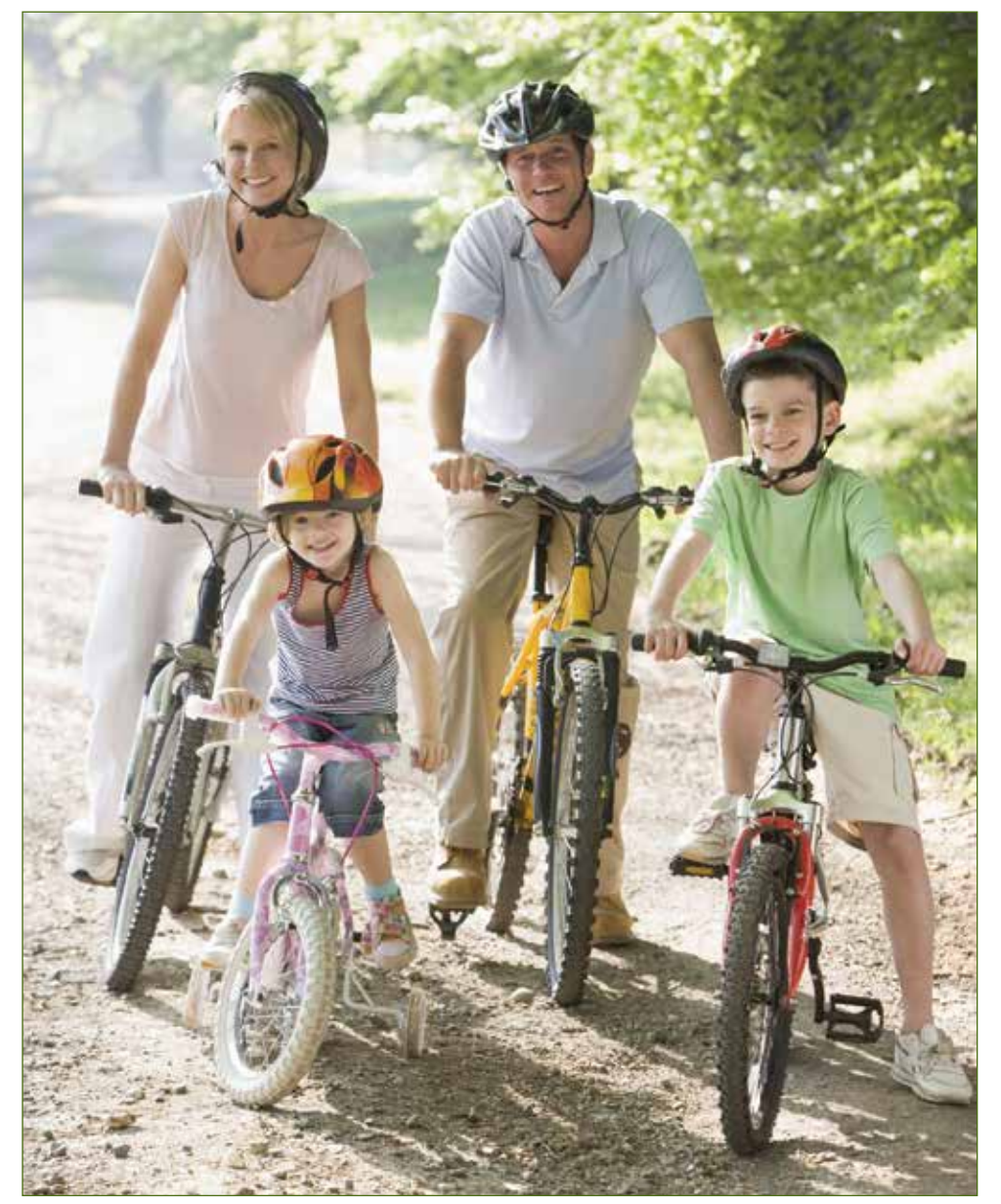
Mount up for the Breakfast Bike Ride June 29 on the Monarch Levee Trail.

The clinic is designed to teach participants to dive off a diving board. Each session begins with the basics, forward approaches, back presses, and line-ups. Divers will learn by building skills through drills. Emphasis will be on teaching front dives, back dives, front