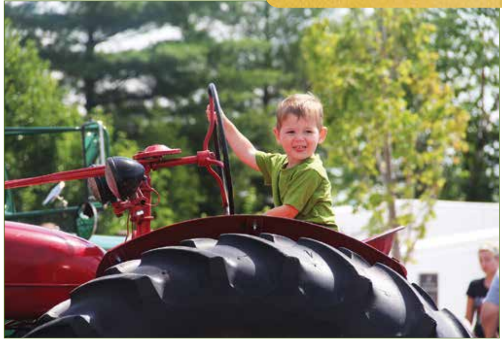
Giant tractors and other big working machines are the star attractions at Kemp Auto Museum's annual "Big Truck Day" June 2.

Please bring a nonperishable food item to support Operation Food Search. Refreshments, including snow cones and BBQ, will be available for purchase. The event is from 10 a.m. to 3 p.m.