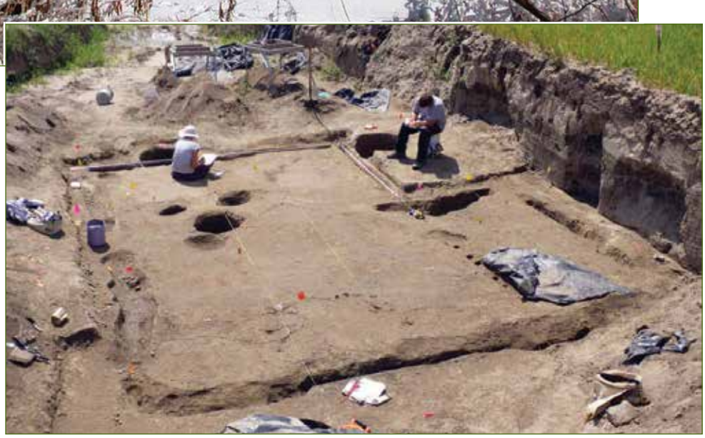
An L-shaped temple uncovered at the Dampier Site in Chesterfield Valley.

For decades Chesterfield, Missouri has been the focus of professional archaeological research. Did you know that mastodon-era hunters camped on a hillside near Faust Park? Did you know that the largest surviving burial mound in St. Louis County is located in Chesterfield? Have you heard about the massive 1,000-year-old market & ceremonial center that was recently excavated in the Chesterfield Valley?