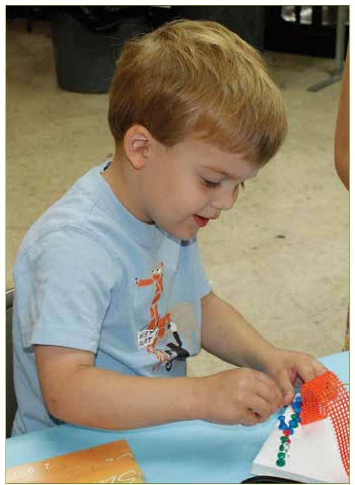
A youngster works intently on a push-pin art project.