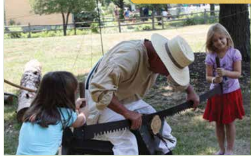
Two volunteers help with a demonstration at Olden Days of Summer at Faust Park.

Mad Science brings its fun and educational programs to the St. Louis Carousel for eight weeks. These programs allow preschoolers to participate in experiments and demonstrations and receive a take-home item at the end of the program. Both child and one adult will receive a ride on the Carousel. $12 per class, and advanced registration is required. Stop by the Carousel Gift Shop or call 314.615.8383 to reserve a spot.