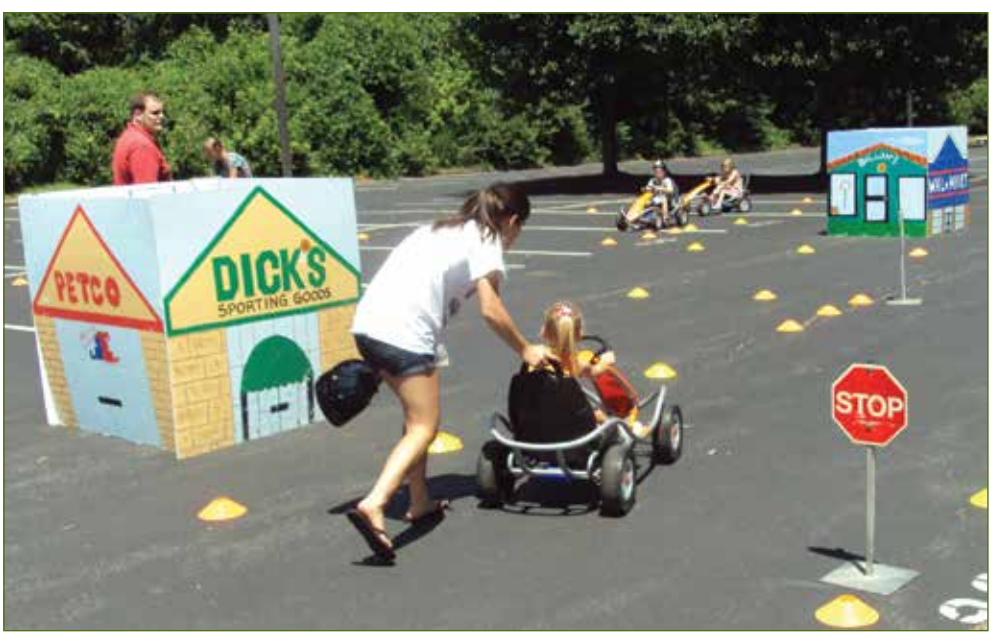
Young children begin to acquire street smarts at Chesterfield's popular Safety Town.

All Safety Town sessions for 2013 will be held at Parkway Early Childhood Center, 14605 Clayton Rd., Ballwin. Registration preference is given to children who have not previously attended Safety Town. The cost of the program is $10 per child, which includes a Safety Town T-shirt, bicycle helmet and